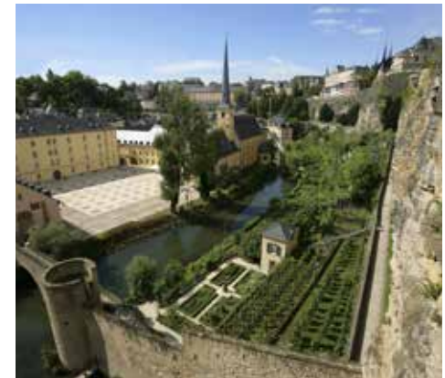
Grund quarter

The guarantees provided by the Treaty of London did not, however, prevent Luxembourg from being invaded by German troops in 1914. The occupation was restricted to the military sphere. The Luxembourg authorities protested against the German invasion, but demonstrated absolute neutrality towards the warring parties. Grand Duchess Marie-Adélaïde and the government remained in power, which was to have political repercussions in the aftermath of the First World War.