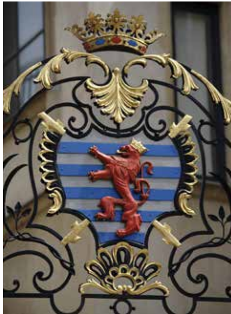
Coat of arms on the grand-ducal palace

The coat of arms has enjoyed legal protection under the law on national emblems of 23 June 1972, amended and supplemented by the law of 27 July 1993.