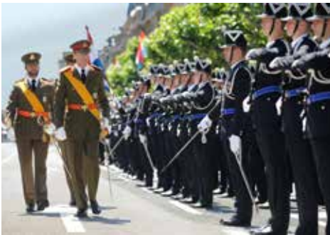
HRH the Grand Duke, followed by his son the Hereditary Grand Duke, attending national day celebrations

The Constitution gives the Grand Duke the formal right to organise his government freely, i.e. to create ministries, divide up ministerial departments and appoint their members. In practice, the Grand Duke is guided by the results of the five-yearly legislative elections in his appointment of an