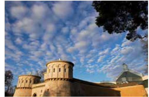
The Musée Dräi Eechelen with the Musée d’art moderne Grand-Duc Jean in the background