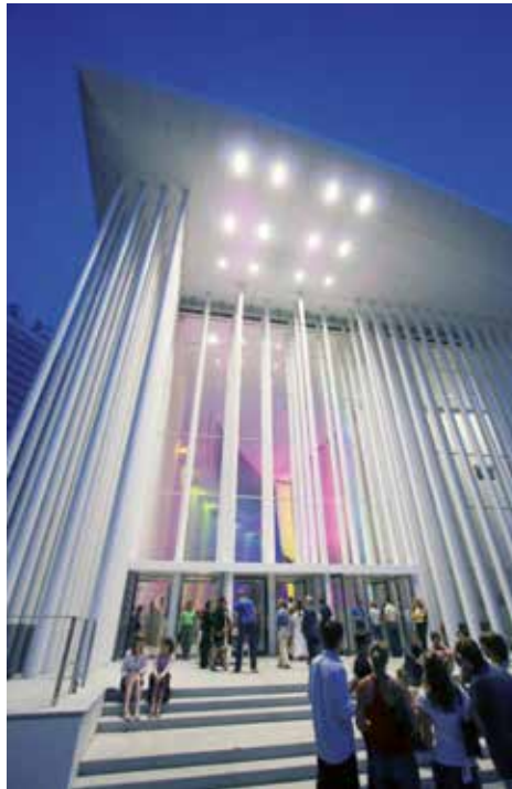
Philharmonie