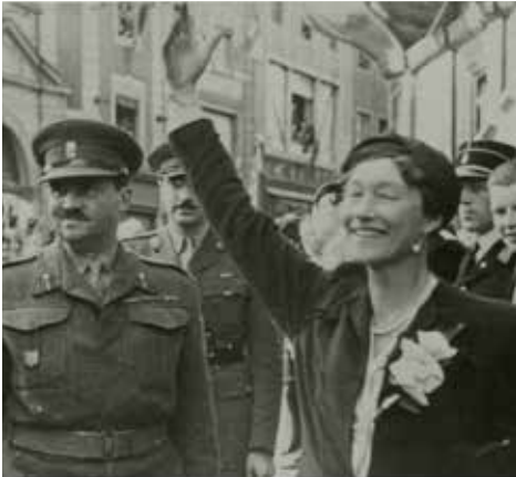
The Grand Duchess Charlotte in 1944

In September 1919, the Luxembourg government decided to organise a two-part referendum bearing both on the form of state (monarchy or republic) and on the economic direction of the country following the denunciation of the Zollverein. The population, which was enjoying universal suffrage for the first time, voted overwhelmingly in favour of the monarchy and an economic union with France. When France withdrew, the Luxembourg government forged an economic union with Belgium in 1921, the Belgo-Luxembourg Economic Union (BLEU). Luxembourg adopted the Belgian franc as the currency of the BLEU, while retaining a limited issue of Luxembourg francs.