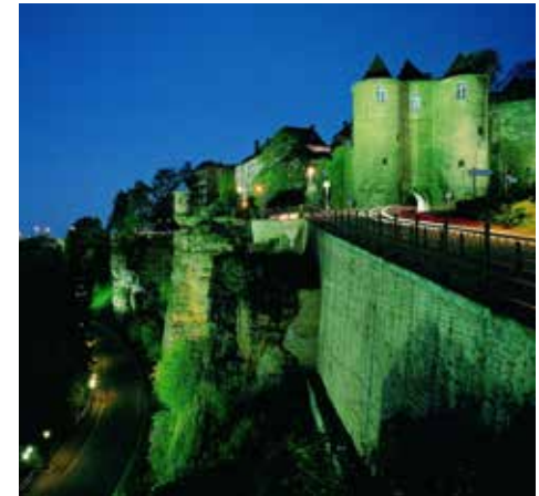
Old fortifications of the capital

The collapse of the Napoleonic Empire in 1815 also had repercussions on the status of Luxembourg. The major European powers that gathered at the Congress of Vienna in that year decided to create a vast kingdom of the Netherlands to thwart any possible French ambitions. Elevated to the rank of grand duchy, Luxembourg was theoretically autonomous, but bound in a personal union to William I of Orange-Nassau, king of the Netherlands and grand duke of Luxembourg. At the same time, Luxembourg's membership of the German Confederation entailed a Prussian garrison being stationed within the fortress.