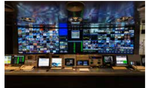
The digital network operations room of SES

In this context, in addition to a large number of small and medium-sized enterprises (SMEs), multinational names from the digital economy such as Amazon.com, eBay, PayPal, iTunes and Vodafone have also established themselves in the Grand Duchy. They confirm Luxembourg's position as a hub for companies operating in data processing, e-commerce and the communications sector in general.