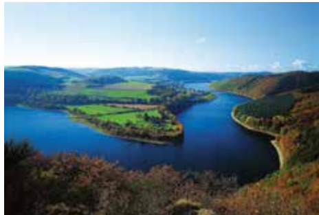
Haute-Sûre lake