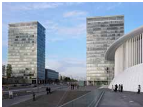
Kirchberg quarter

Luxembourg is seen as a model for openness and a microcosm of Europe with its population comprising 45.3% of foreign residents. The country's small size has enabled it to maintain an image of harmony "on a human scale".