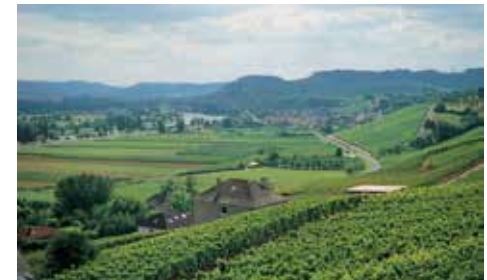
The Moselle region: its river and vineyards